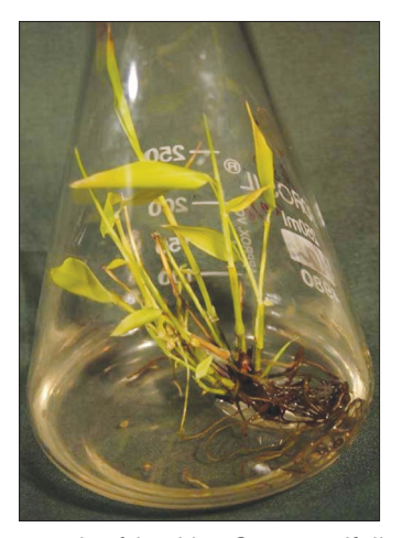
Figure 2: The growth of healthy G. angustifolia shoots in the multiplication medium after treatment with kanamycin. The treatment of shoots with kanamycin (10 \mu g/ml) grossly inhibited the bacterial growth without affecting their quality and shoot numbers

The common problem of bacterial growth around in vitro shoots in Guadua angustifolia tissue culture is due to