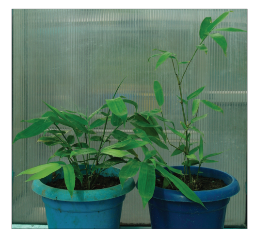
Figure 3: Acclimatized plants of G. angustifolia. Plantlets were transferred to plastic pots containing sand in polytunnels and covered with jars to maintain high relative humidity. After 1 month of hardening, these plants demonstrated 90% survival when transferred to pots containing 1:1:1 mixture of soil, sand and manure

(1) Pantoea agglomerans and (2) Pantoea ananatis. This can be resolved through treatment of G. angustifolia shoots with kanamycin for 10 days. No phytotoxicity appeared when shoots were treated with kanamycin (10 \mu g/ml) and the multiplication rate of treated G. angustifolia shoots was found to be similar to that of healthy plants. Streptomycin sulfate, at higher concentration, also inhibited bacterial growth during micropropagation of G. angustifolia . In addition, shoots grown in streptomycin sulfate tended to be shorter and have stunted leaves. Thus, our study provides us with a technique to identify and resolve bacterial contamination of (1) Pantoea agglomerans and (2) Pantoea ananatis during in vitro culture of G. angustifolia .