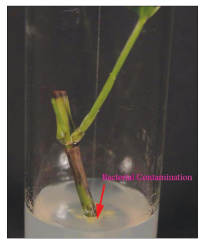
Figure 1: Bacterial contamination in the region around shoot base in the agar medium. The bacteria appeared as creamish white growth around the base of shoots in the agar gelled medium after 20 days of inoculation

We utilized 16S rRNA gene sequence analysis to identify bacterial contaminants [Figure 1] in Guadua angustifolia Kunth. These contaminants were found to be highly similar to Pantoea agglomerans (NCBI # FR872702) and Pantoea ananatis (NCBI # FR872704). Both bacteria are gram negative and closely related.<sup>[16,17]</sup> P. ananatis is a common epiphyte. It infects both monocotyledonous and dicotyledonous plants. It also occurs endophytically in hosts where it has been reported to cause disease symptoms.